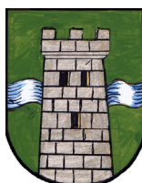
Gemeinde Lebring-St. Margarethen